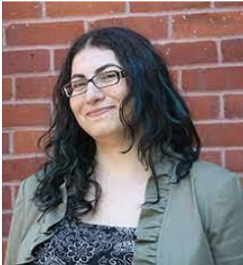
Website: http://www.leahbobet.com